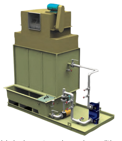
Liquid desiccant packaged conditioner