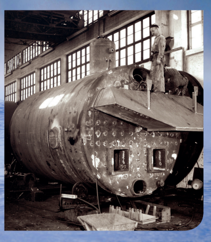
GO DEEPER AND LEARN MORE AT WWW.ALFALAVAL.COM/AALBORG100 >

Alfa Laval Aalborg boiler solutions encompass boiler, combustion and control technologies, as well as the services and know-how to secure uptime and ongoing efficiency. As the marine industry sails towards new challenges and opportunities, we're providing the steam to keep it moving forward.