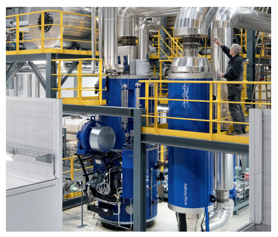
Multi-fuel Aalborg boiler at the Alfa Laval Test & Training Centre

"When we pioneered it in the 1960s, we couldn't have imagined the importance of waste heat recovery today," Jørgensen says. "Back then, heating boiler surfaces with exhaust gas was a novelty. Today, it's an integral part of saving fuel in an era of energy efficiency."