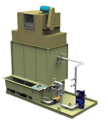
Liquid desiccant packaged conditioner

Email: sales.kathabar@alfalaval.com Web: www.kathabar.com