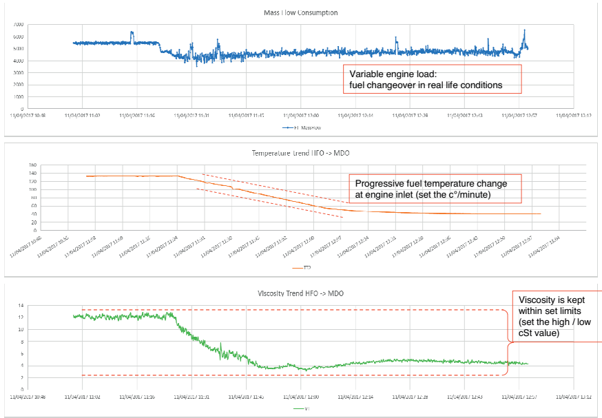
This graph shows the smooth fuel changeover process with FCM One. Engine load can still change whilst temperature transitions smoothly.