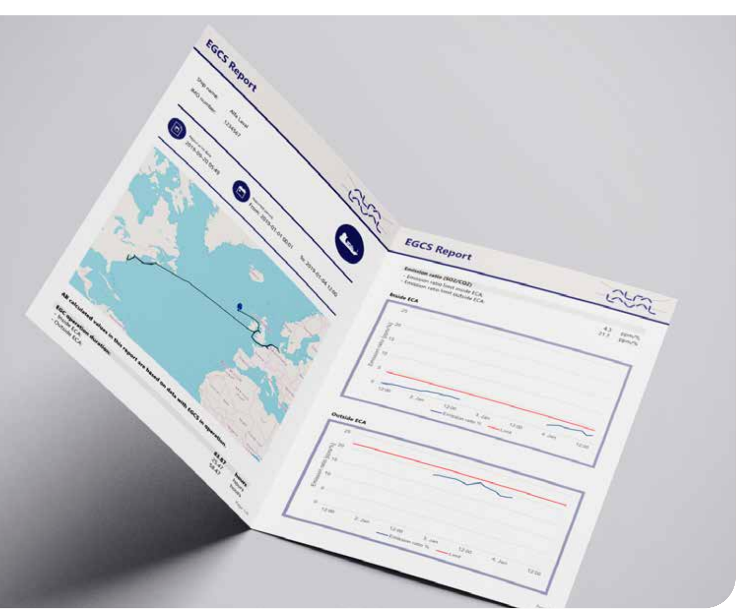
Example of a localized, graphical compliance report

Reporting SOx scrubber compliance can be a significant hassle. Digital services help simplify the process by automatically generating localized reports where all compliance values are shown graphically, as in Figure 2. When a vessel moves between compliance regions, the compliance limits are automatically adjusted. This means the reports can be handed over directly to regional authorities, without additional effort.