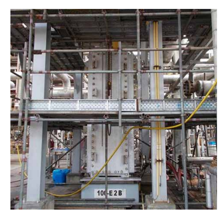
Compabloc on site at PTTGC's Aromatics Complex 1 plant. The small footprint makes Compabloc easy to fit into existing structures.

The operating data clearly show the superior heat recovery capabilities of the installed Alfa Laval Compabloc. The ability to work with a crossing temperature programme and a very small approach temperature makes Compabloc the perfect choice for heat recovery duties.