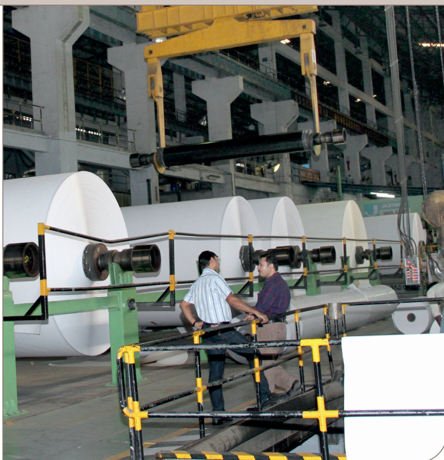
Manufacturing of specialty papers and paperboards at ITC's plant in Sarapaka, Andhra Pradesh.