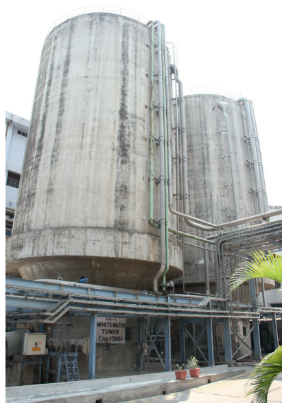
A broke tower at the Sarapaka plant fitted with Alfa Laval's Toftejorg rotary jet heads.