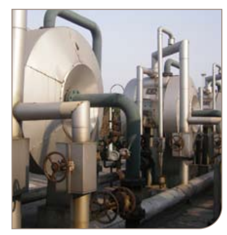
The single-channel technology, spiral shape and hinged door make the Alfa Laval spirals long-lasting and easy to maintain.

"Working with a company with such a broad range of on-site experience and innovative character, we feel inspired by their pioneering, and it makes us confident that we can continue to lead the way in our area of operation."