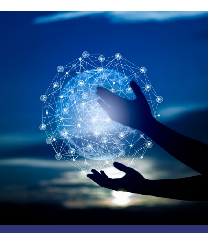
Reduce cost and increase uptime with faster, more accurate troubleshooting